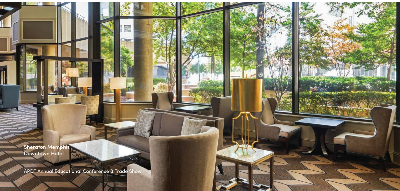
Sheraton Memphis Downtown Hotel

Some companies have been known to solicit meeting attendees and exhibitors with offers of lower rates or nonexistent inventory of hotel rooms. Often referred to as "housing pirates" or "housing bandits," they will phone or email attendees and exhibitors of city-wide events such as this one. It is important to remember