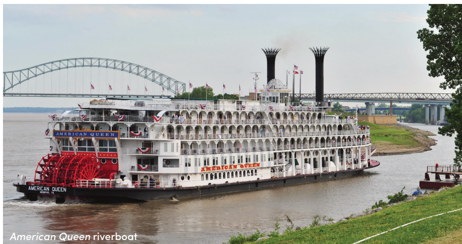
American Queen riverboat

Not only do we get it, but the world does too. Many of our attractions were voted number one in USA Today's 10 Best lists including Graceland, National Civil War Museum, Memphis Zoo, Sun Studio and Stax Museum of American Soul. Money Magazine named Memphis #3 Most Affordable Destination and Fodor's listed the city as the #6 destination on their 2018 'Go List.'