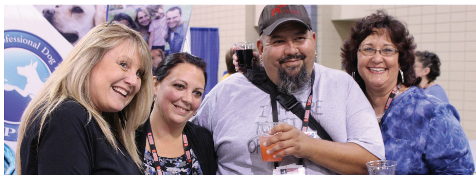
Exhibit Hall Activities