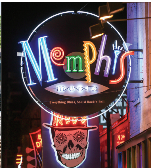
Blues Hall of Fame