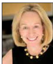
Doris Kearns Goodwin