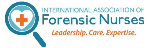
Exhibit Dates: October 24–26, 2018