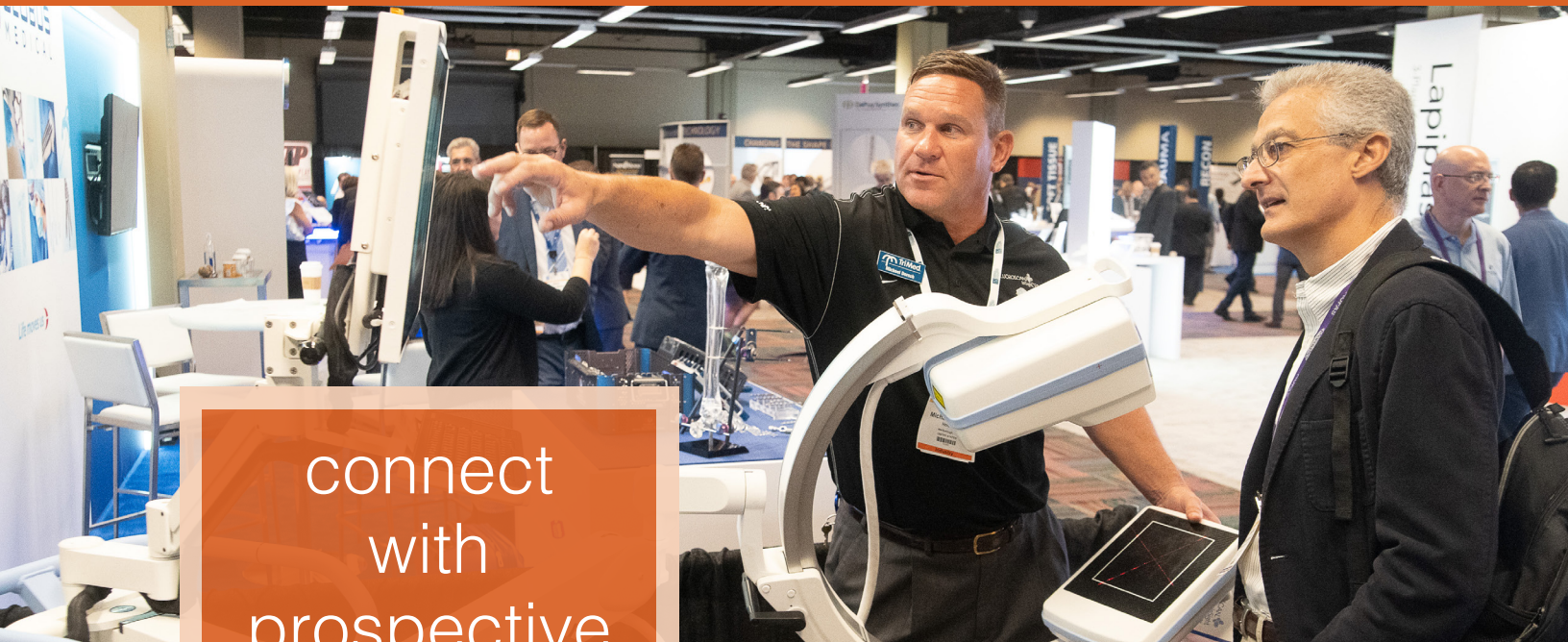
EXHIBIT OPPORTUNITIES 2020

connect with prospective foot and ankle customers