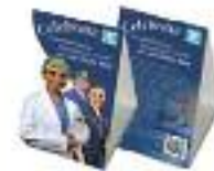
Table tent advertising in the GAPNA Networking Areas within the meeting space and exhibit hall provides great exposure in busy gathering areas seen by hundreds of attendees each day.