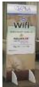
Table Tent Advertising ..... $1,000 for (5) table tents (front & back)

Free Standing meter board signs are an effective affordable way to communicate with GAPNA attendees. These two-sided meter boards display your artwork in high traffic areas within the exhibit hall and GAPNA convention space which can carry your corporate logo and booth number.