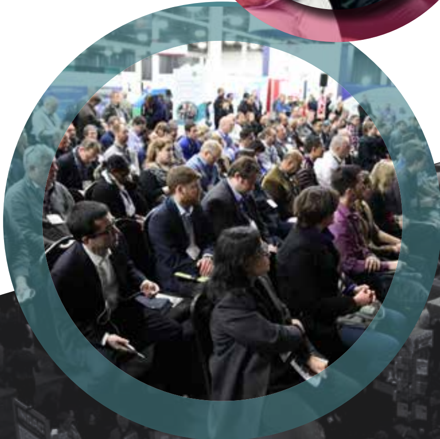
Exhibit at Foam Expo

Access a powerful sales and marketing tool