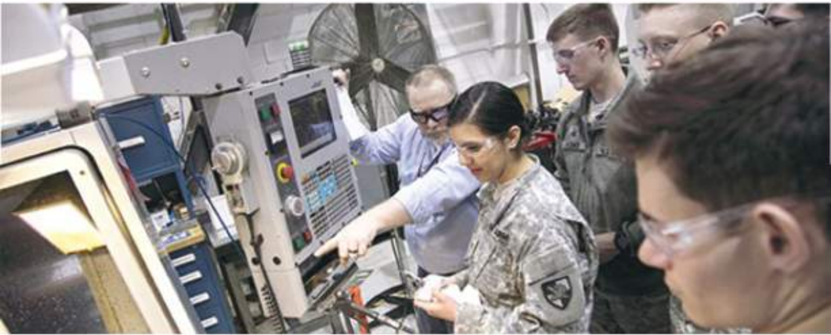
EXHIBIT & SPONSORSHIP PROSPECTUS