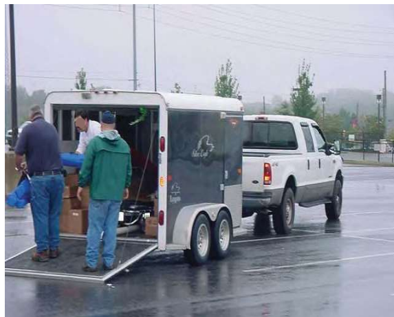
COMPANY VEHICLE EXAMPLE